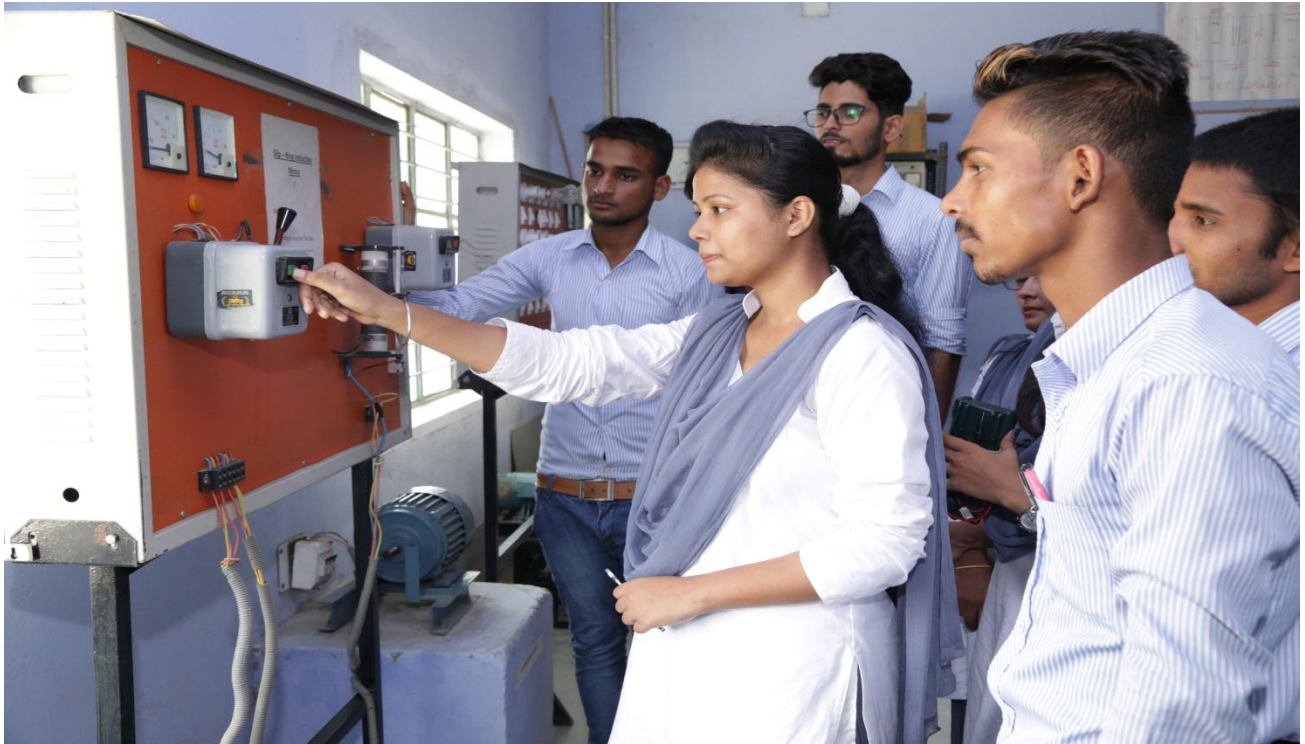
Photo : Lab Class in a Group