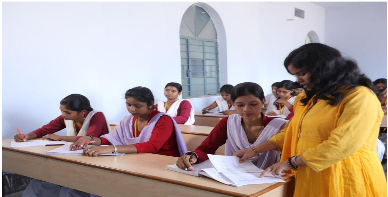
Photo : Class Room