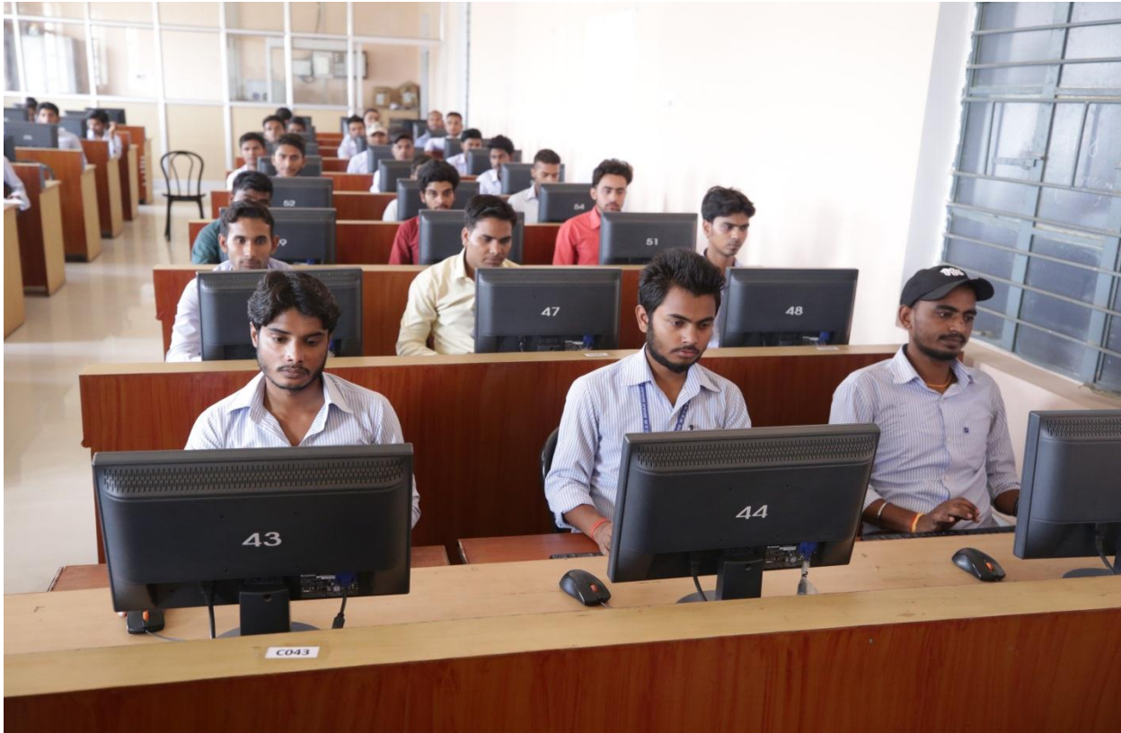
Photo : Computer Lab